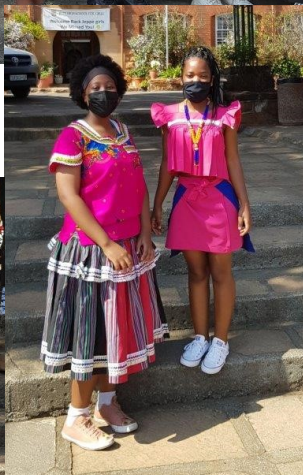
The Matrics in their heritage attire.