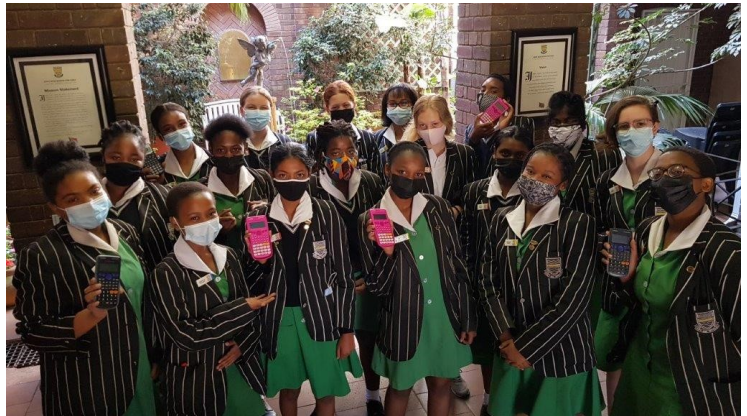
2021 Winning Tour de Maths Team