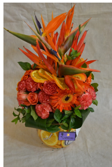
category were donated to the Strathyre Girls Home.