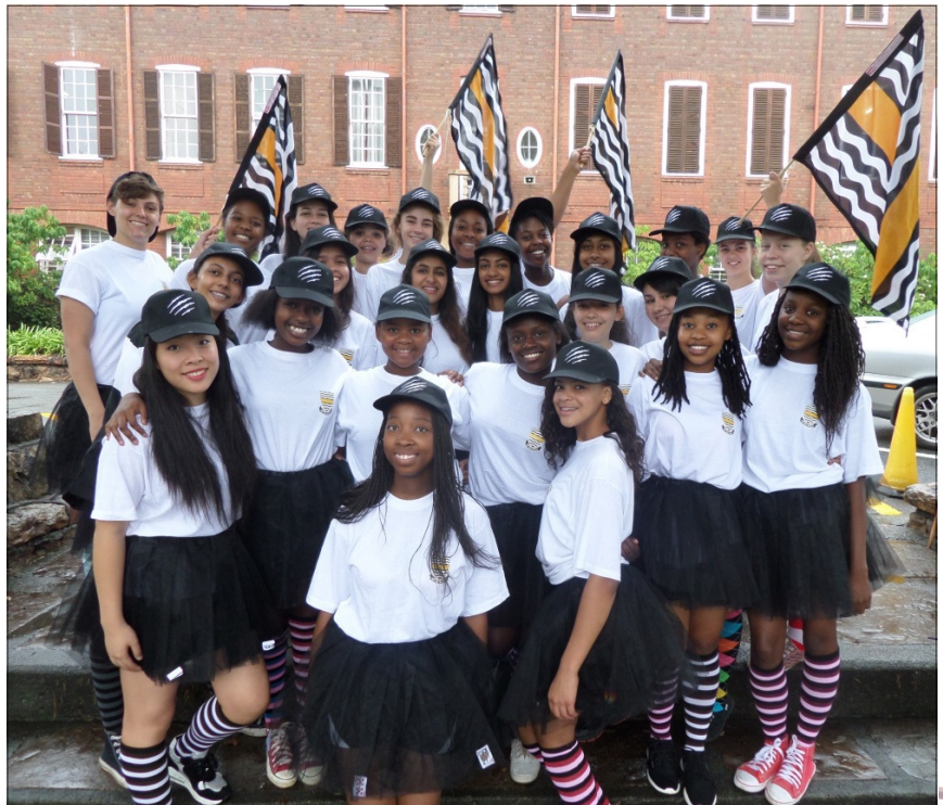
The 10th March dawned a dreary day but nothing could dampen the spirits of our Councillors (seen above) who posed in front of the school before going to Ellis Park to lead the Grade 8s in supporting our swimmers at this year's Inter High Gala. (See page 5 for the full story).