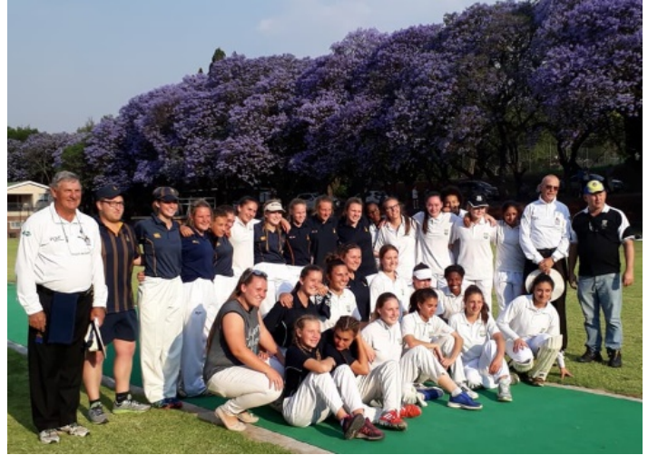
The 2nd X1 with Monument High, coaches & supporters.

Our first cricket team definitely has some of the greatest school spirit Jeppe has ever seen. For the last three years they have won the trophy of the Central